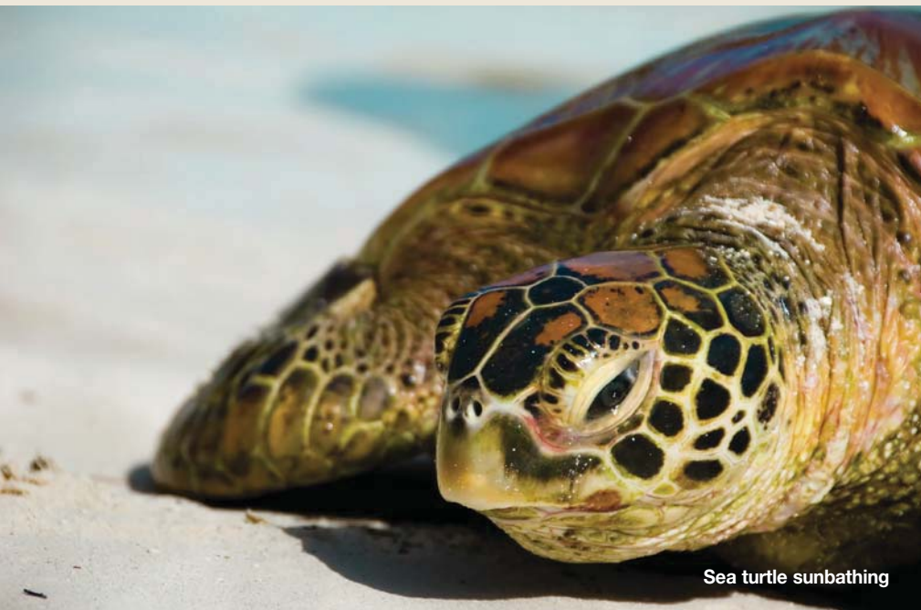
Sea turtle sunbathing

All room locations and prices are subject to availability. Deposit and cancellation policies for categories OS, VS, and OC differ from those listed in this brochure. Please call for details.